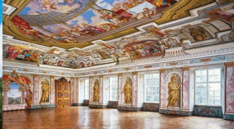
Baroque Emperor hall in Augustine Monastery