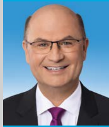
Albert Füracker, MdL State Minister

We wish you a fascinating visit to the castles of King Ludwig II!