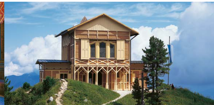
King's House on Schachen

This small palace built for Ludwig II is magnificently located at an altitude of over 1800 m against the backdrop of the Wetterstein massif in the Alps. The wooden building has a rather modest exterior and simple rooms on the ground floor, but the hall occupying the first floor is furnished with oriental splendour. The king sought the seclusion of the mountains to celebrate his birthday and his name day in the lavishly decorated Turkish Hall furnished with divans and a fountain. The King's House can only be reached on foot, either from Elmau, Garmisch-Partenkirchen or Mittenwald.