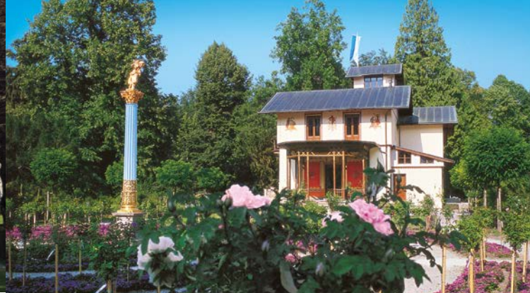
The rose garden on the east side of the Casino