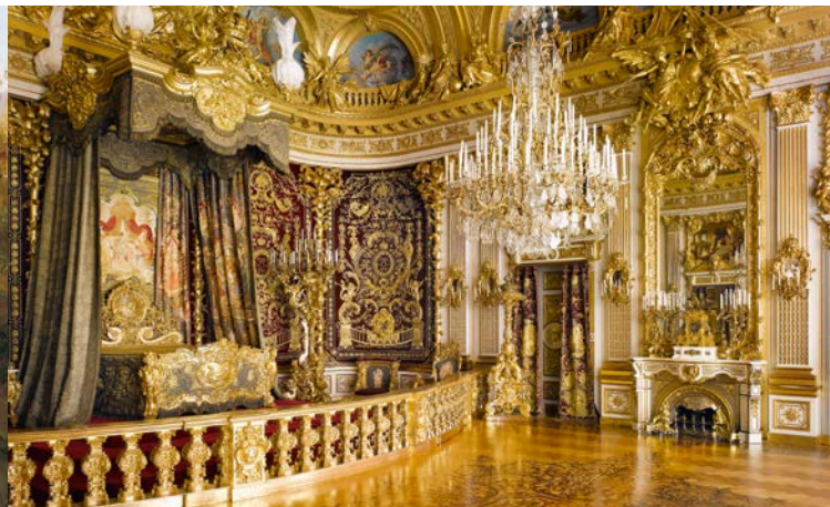
The State Bedchamber in Herrenchiemsee Palace

This monument to Absolutism which is far more magnificently furnished than the palace of Versailles on which it was modelled, was begun in 1878. The State Bedchamber in the Large Apartment is the most expensive room of the 19th century. The porcelain in the Small Apartment is the largest single order ever received by the Meissen manufactory and the richness of the embroidery on the textiles is beyond comparison. In this palace Ludwig II conjured up kingship with all the means at his disposal. The building remained incomplete, as did also the park around it, which was modelled on Versailles with its splendid fountains and intended to cover most of the island; today the gardens are surrounded by a natural area with important biotopes. In the palace, the comprehensive Ludwig II Museum documents the life and work of the man described by Paul Verlaine in 1886 as the 'only true king of the 19th century'.